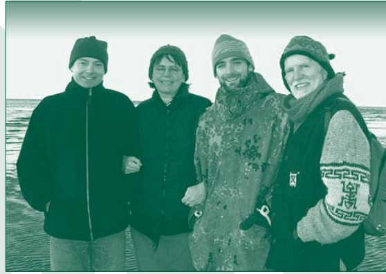
Some members of the core team

"Never doubt that a small group of committed citizens can change the world."