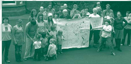
Residential bodhi-building weekend